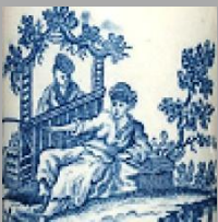
Printing on porcelain 1750-1800