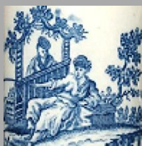
Printing on porcelain 1750-1800