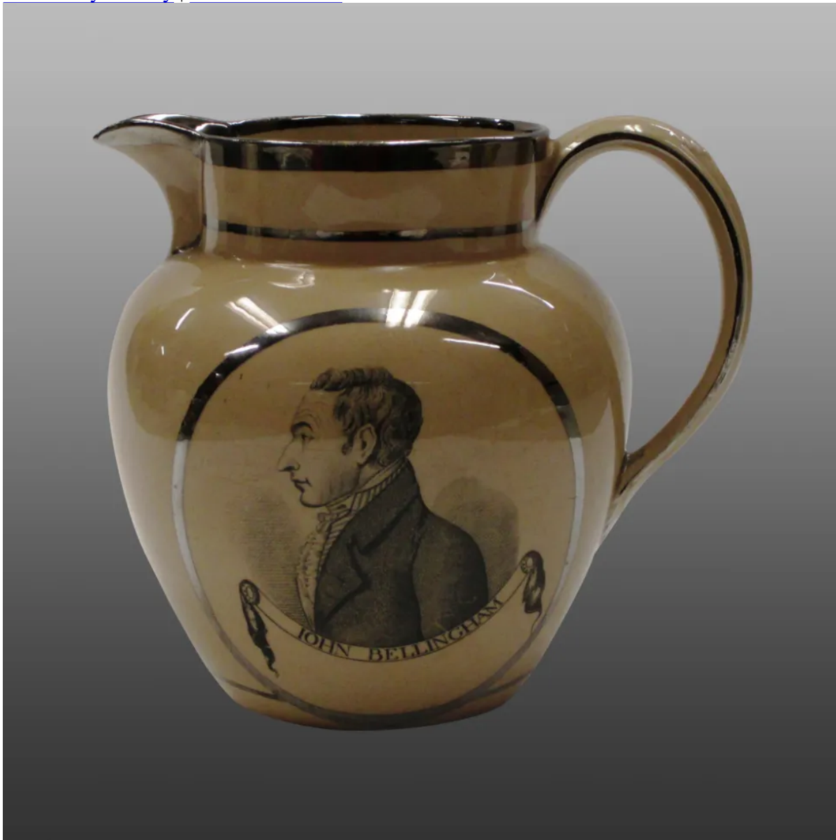
Potteries Museum & Art Gallery, Stoke-on-Trent (Cer_1492)