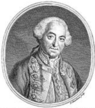
The Hon ble EDWARD BOSCAWEN, Admiral of the Blue Squadron.